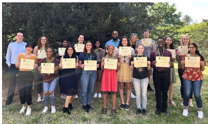
Current Honors and UG students engaged in research (May 2022)

I have worked at Atrium Healthcare for roughly eight years, and at UNC Charlotte for over eighteen years now. As a scientist, I have traveled for collaborative work and presentations in the USA and internationally. As a research scientist running a lab, you serve as the CEO and CFO, and staff of a small company raising funds, allocating those resources, hiring collaborators, monitoring and reporting progress. Research, especially biological sciences and cancer research, became a career along the way based on amazing teachers and mentors and an unwavering focus on furthering our understanding of cancer and of developing best therapeutics.