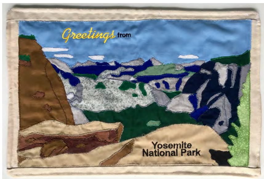
One of the pieces showcased in the 2018 Annual Student Juried Show

I was also in the Statement Making fashion show on campus for both 2017 and 2018. For the 2017 show I had three garments: I Have Hair and I Don't Care , Consent is Sexy , and You Don't Get to Label Me . For the 2018 show I had one garment: Don't Waste Water .