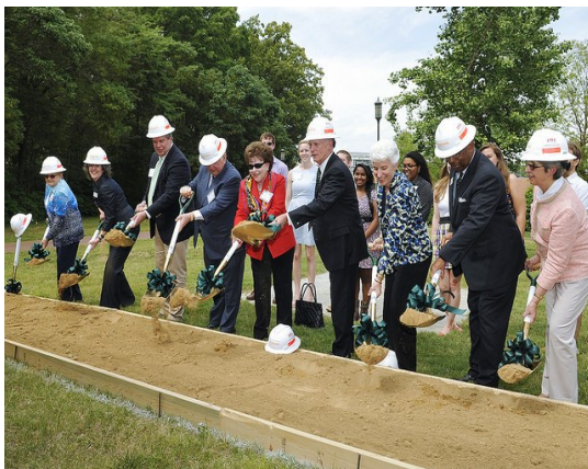
Levine Hall groundbreaking ceremony in May 2015