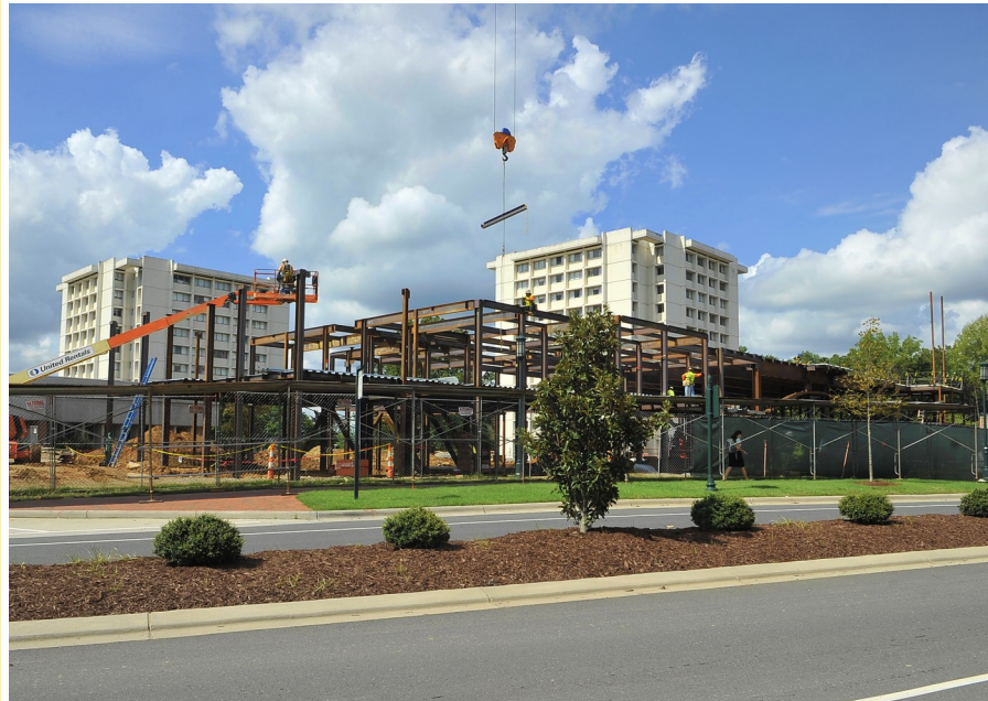
The construction of Levine Hall

The new building is located off of the traffic circle at the University City Blvd. entrance to campus, and will be the gateway to South Village. The large quad behind the building will serve as a terrific open space for honors and merit scholar program activities and events. We can hardly wait to be together in our new home!