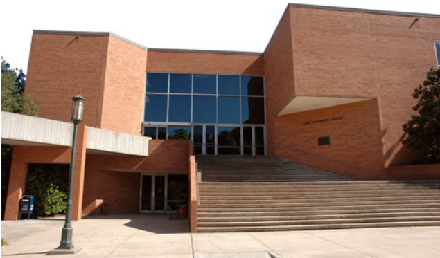
The Bonnie E. Cone Center, where the Honors College administrative officers are housed in our office suit at 369 Cone