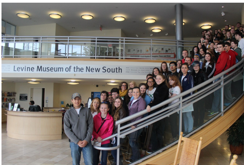
UHP students at the Levine Museum of the New South

75 students from the Honors Freshman Colloquium course participated. Prior, students read about the history of uptown Charlotte and wrote a pre-reflection as part of their colloquium course. Students were assigned to groups and each group was responsible for organizing their transport to Uptown Charlotte via public transit. The day of the event, students met at the Levine Museum of the New South for a morning briefing. Students were then released in exploration groups for four hours with instructions to talk to as many people as possible during that time. Students recorded conversations, took pictures, and made videos to document what they learned in the city by talking to a variety of people. A debrief was held with the entire group later in the afternoon to compare experiences and draw conclusions. Students completed written post-reflections with their colloquium sections.