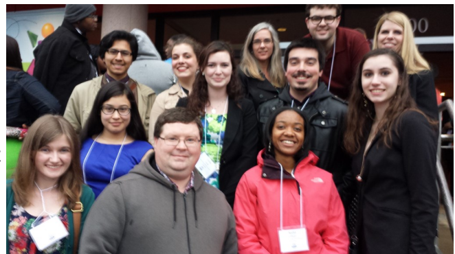
UNC Charlotte honors students at the SRHC Conference