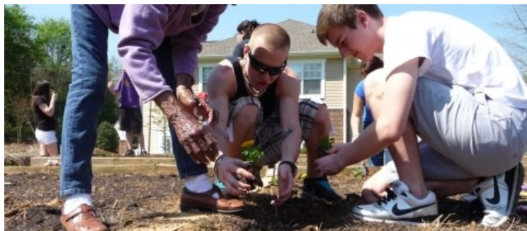
Planting a garden in Washington Heights