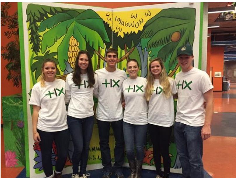
UHP students at ImaginOn in Charlotte