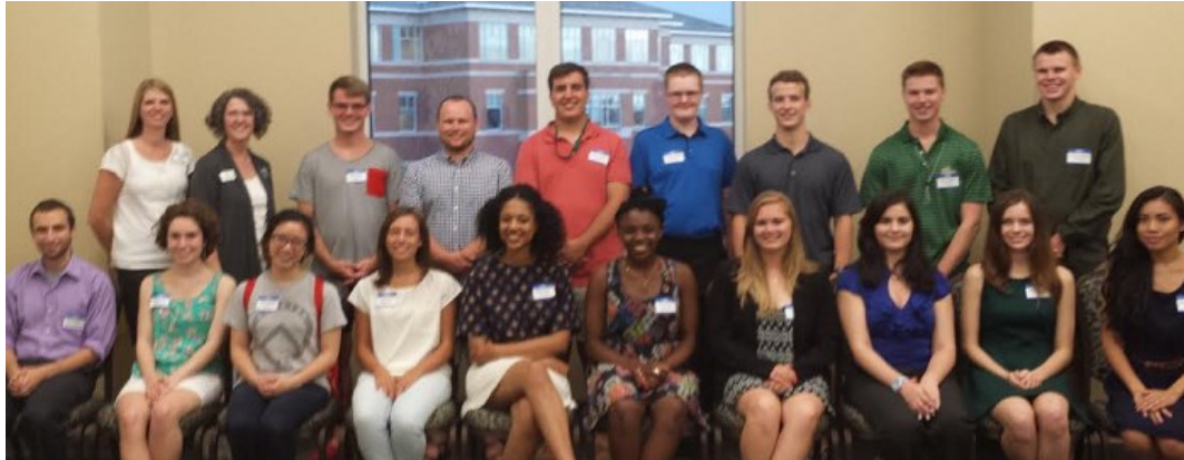
2015-2016 class of Crown Scholars with continuing students