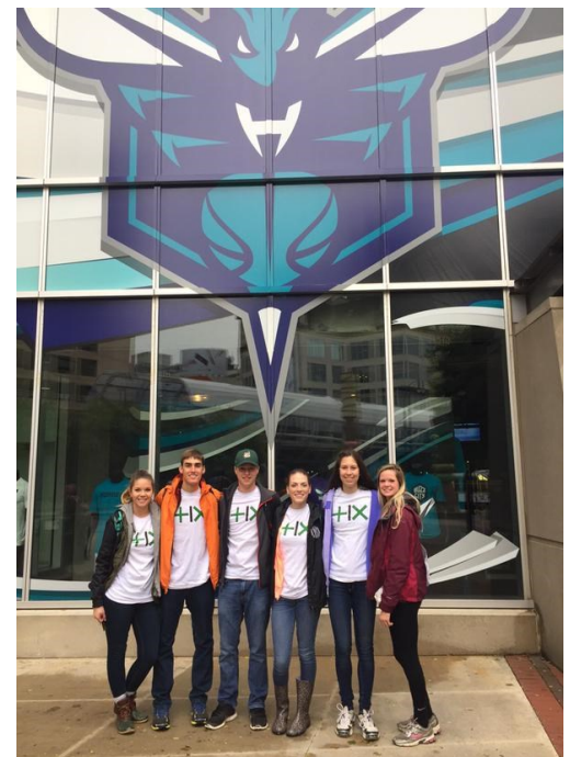
UHP students visiting Time Warner Cable arena, home of the Charlotte Hornets