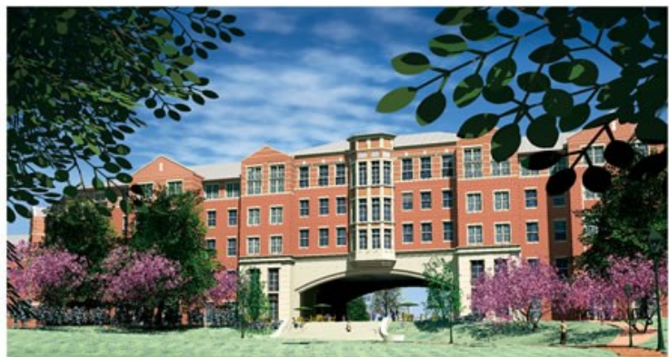
Model of a completed Levine Hall