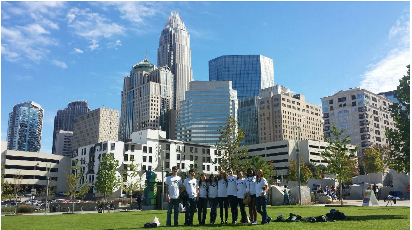
UHP students at the City of Text © event in uptown Charlotte

City as Text© events are applicable to differing sites, and equally seductive to students and to faculty. They have proven to be catalysts for involvement in conference events and to have provoked long-term sensitivity and reflection about the human experience in the built environment. http://wagner.edu/honors/files/2007/11/City-as-Text-by-Bernice-Braid.pdf .